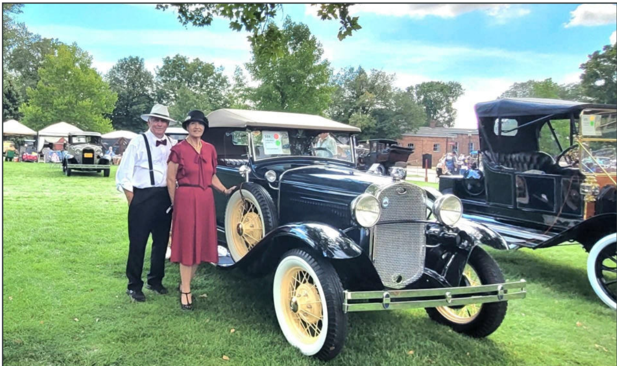
The Old Car Festival 2022 at the Henry Ford Museum, Dearborn, Michigan.