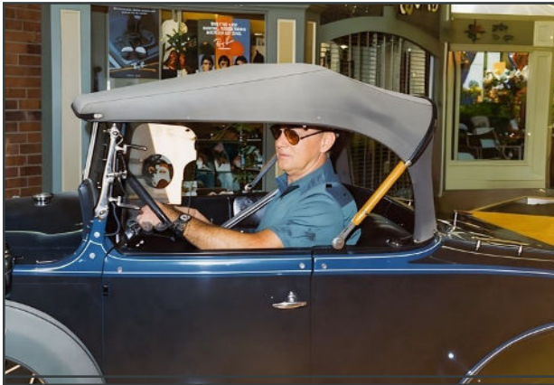
Show inside Bel Air Mall.

The 1931 Model A Deluxe Roadster became an AACA National Junior Award winner, but being born in 1931, Dad had a special love for Model A's. He didn't build this car to be a trailer queen. He and Mom spent almost 30 years touring and enjoying just driving the car. In the early 1980's, they joined the Deep South Region AACA. They especially enjoyed the Mother's Day show that was held at the clubhouse each year.