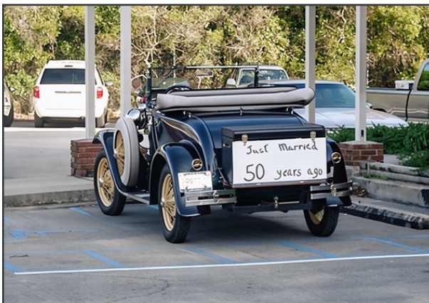
Getaway Car for Mom & Dad's 50th.