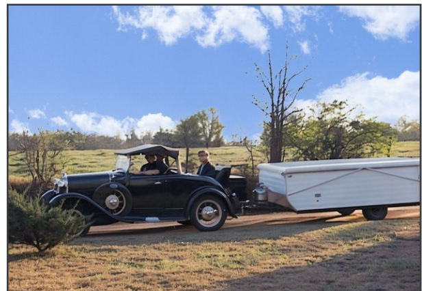
Towing the pop-up camper to Paul B. Johnson.