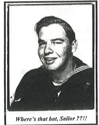
Where's that hat, Sailor ???!