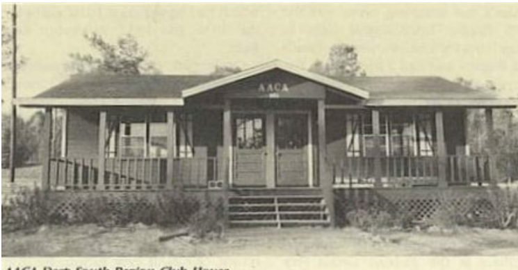
AACA Deep South Region Club House.