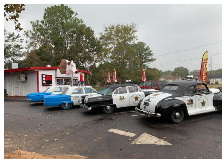
Nothing like local BBQ after a parade!