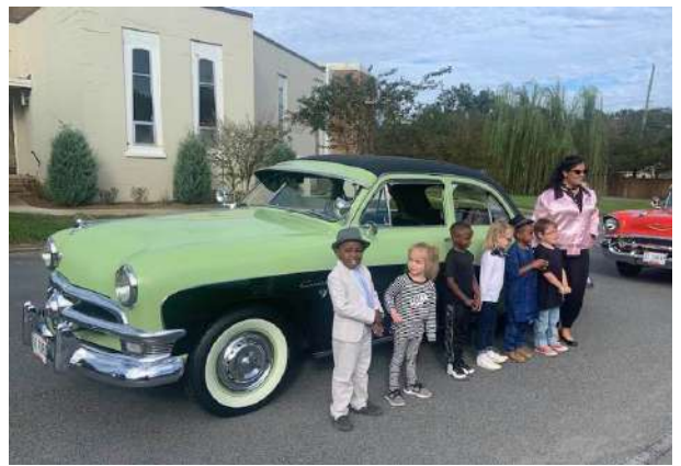
Kids from the school line up in front of the 50' Crestliner