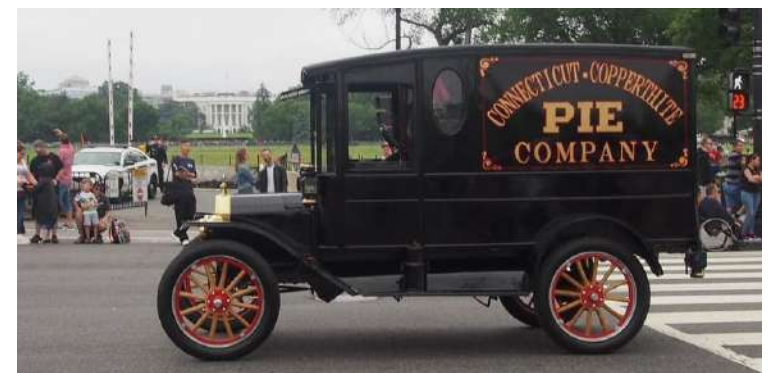
The same truck participated in the 100th Anniversary of the ending of WWI and followed much of that same parade route down Pennsylvania Avenue