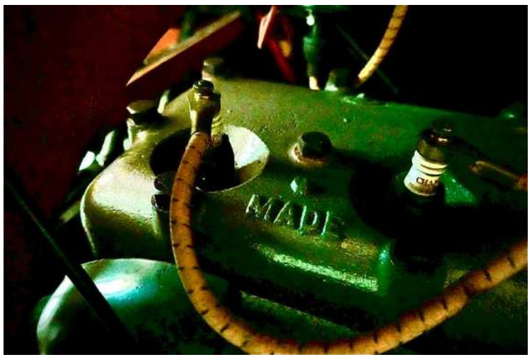
Engine in the 1914 Model T

The Model T Pie Delivery Truck became a show car and was used for special deliveries and annual parades. It was used in 1932 as a display vehicle as it served thousands of pies to the athletes and the spectators of the Games of the X Olympiad.