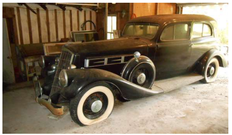
The 1934 Pierce Arrow Model 836A Sedan

My friend asked me if I would help move these cars on to new owners before they deteriorated any further. Recognizing their historical value, the primary concern was to ensure that they went to collectors who would give them the care that they deserved. I immediately told them that I would be happy to volunteer my help, both as a favor to old friends and as a very interesting challenge(A bottle of good Scotch also sweetened the deal!). We got right down to work.