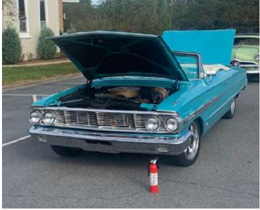
David Ladnier's '64 Ford Galaxie 500