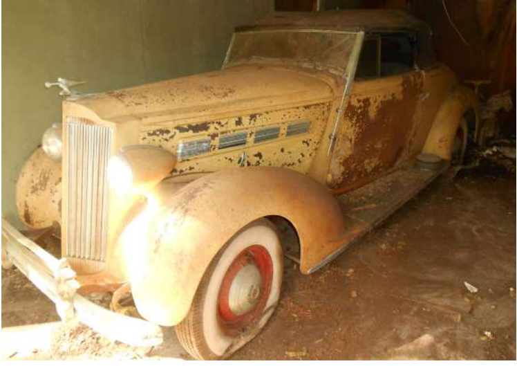
The 1937 Packard Model 115C Rumble Seat Convertible

In addition to their unfortunate condition, we discovered that very little in the form of a paper trail existed for any of the cars, so we began an extensive internet search to both accurately determine the year of production and the model number of each vehicle. Once these basic facts were established a second search was launched to assess the reasonable value of each car in today's market.