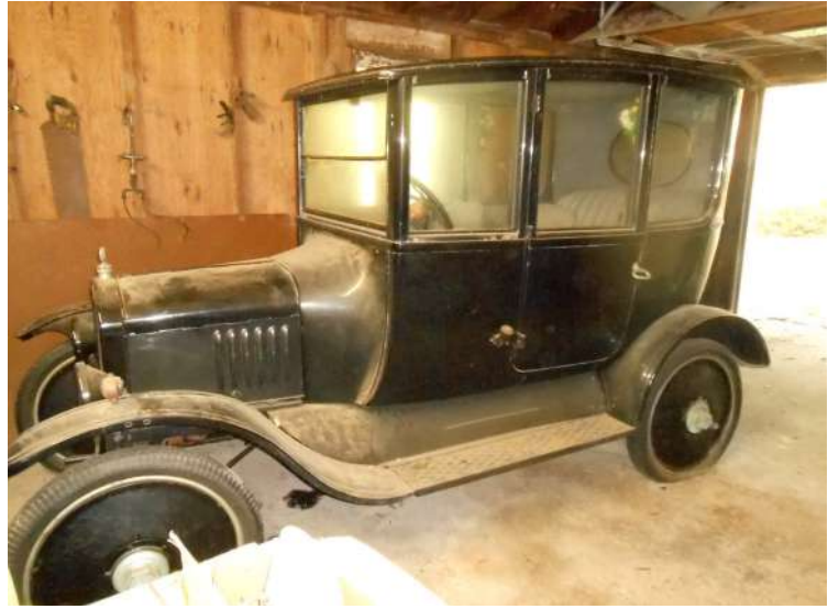
The 1920 Ford Model "T" Center Door Sedan

Our initial step was a visit to the cars. While I appreciated the collectability and the historic nature of these vehicles, it was very clear that time had not been kind to them, as the following images show: