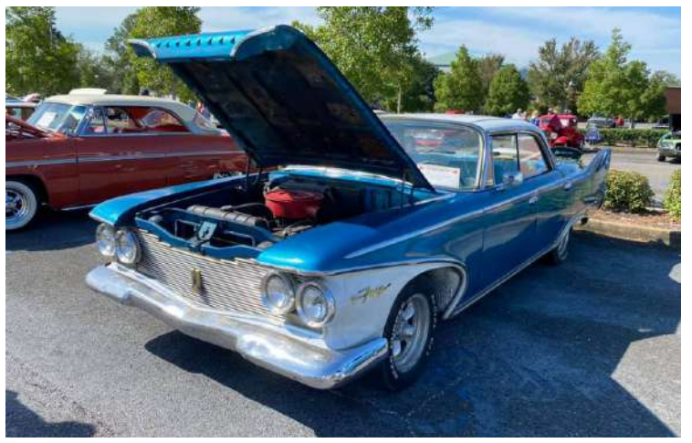
Gavin's Plymouth Furry