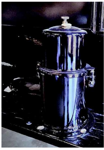
Carbide Generator of the 1914 Truck!