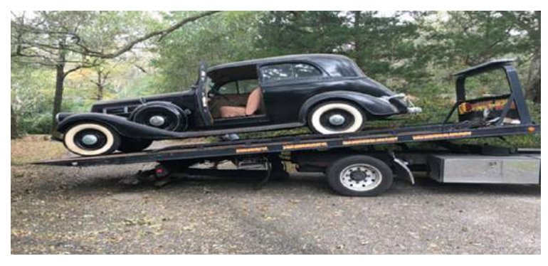
The Pierce Arrow enroute to Chicago.

The final event in this project occurred on Dec 7, 2021, with a local wrecker and an interstate car carrier teaming up to recover and ship the Center Door Sedan and the Pierce Arrow to their new owner in Illinois.