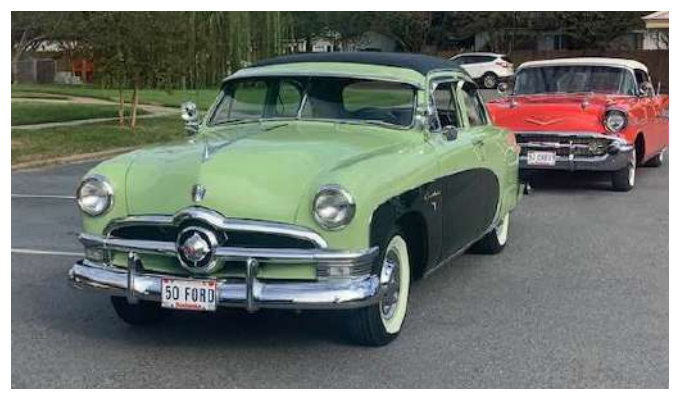
Jim Henderson's 50' Crestliner

On display was a 1950 Ford Crestliner, 1957 Chevy Bel Air, 1966 Valiant Station Wagon and 64 Ford Galaxie 500. Parents cruised through to see the students and the students got to see the cars up close. - David Ladnier