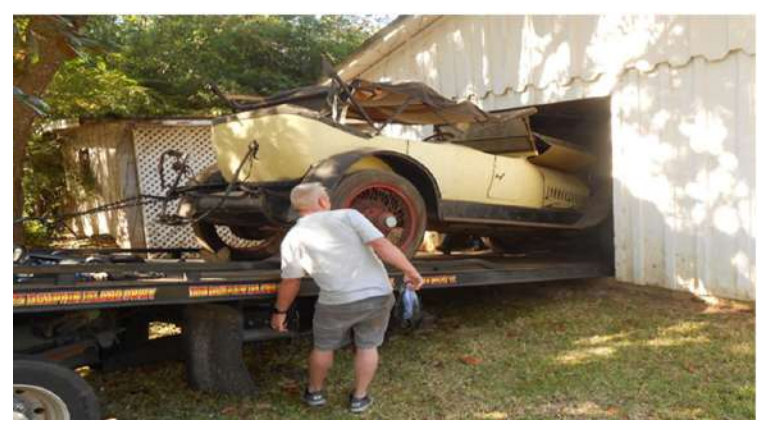
The Owen seeing daylight for the first time in 50 years.

When the dust settled, the Pierce and the Model "T" went to a private collector in Chicago and the Owen went to the Tampa Bay Auto Museum. A visit to their website https://www.tbauto.org is worth the time – their collection is amazing! My friends were particularly thrilled with this, as one of their cars would become a museum display amongst an amazing collection of other historically significant vehicles.