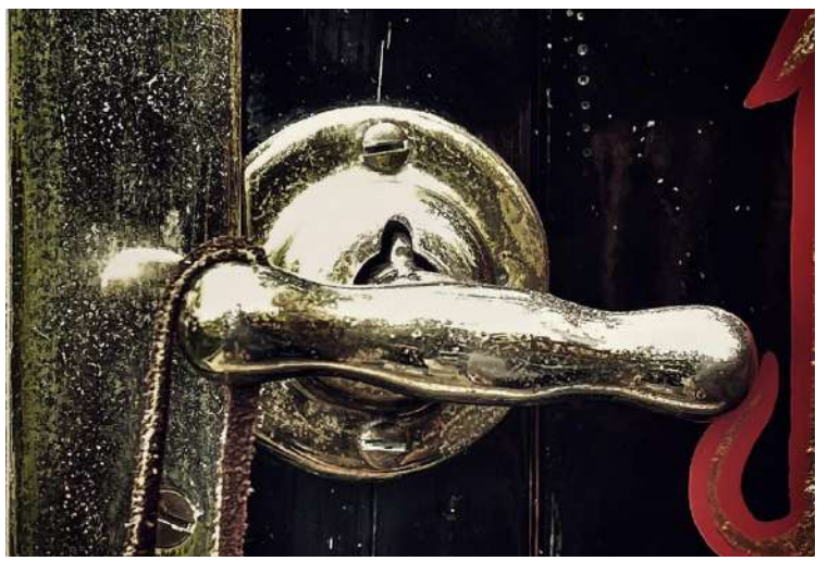
Behind these doors are the finest pies the world has know for over 135 years!

Over 100 Years ago a parade for the returning solders of the Great War (WWI) would be held here in the Nation's Capital. The 1914 Model T Pie Truck of the Connecticut-Copperthite