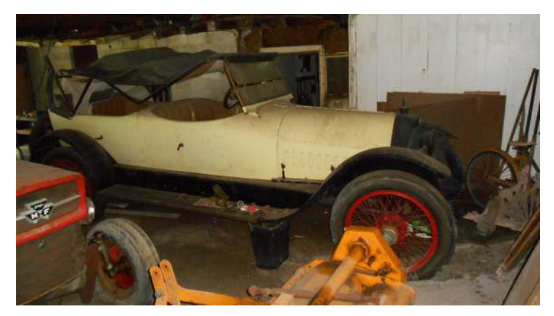
The 1916 Owen Magnetic

In July of this year a neighbor asked for my help in resolving an unusual estate issue. That "issue" consisted of a treasure trove of four classic cars that had been sitting unmolested in buildings on their property for nearly fifty years. Included in this group were a 1916 Owen Magnetic (a super rare car with only about twelve known to exist), a 1920 Ford Model "T" Center Door Sedan, a 1934 Pierce Arrow Model 836A Sedan, and a 1937 Packard Model 115C Rumble Seat Convertible.