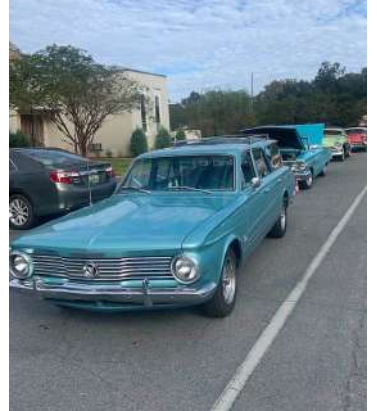
Ernie Roger's '64 Valiant Station Wagon