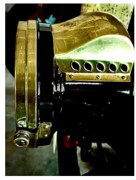
Carbide lamp of the 1914 Pie Truck!