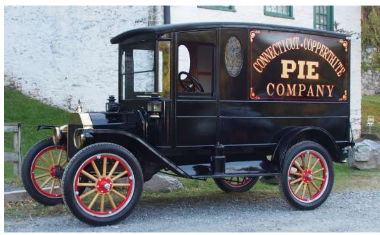
It is always a great day when we can drive our 107 year old truck (and she does not break down)!