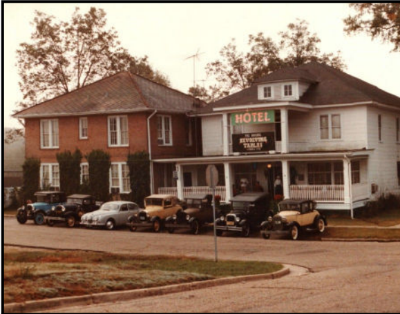
A later tour to Mendenhall after restoration.