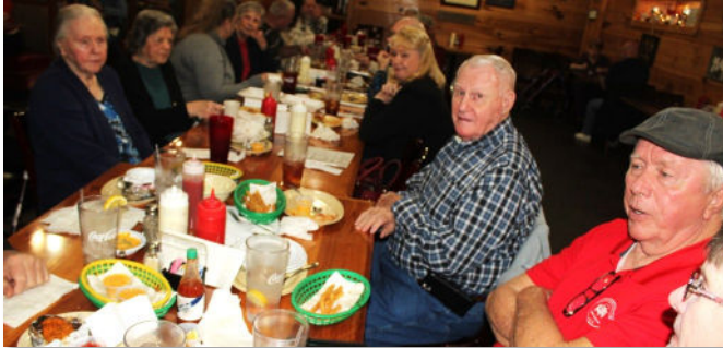
February - Fun Run to Loaves & Fishes Restaurant