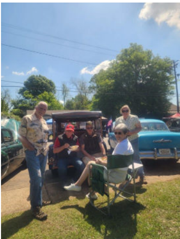
April - Tailgating and Tail Wagging at the ARC of Clarke County Car Show