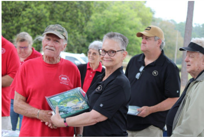
March - 15th Annual Shirley Looney Memorial Car Show