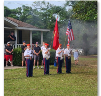
June - Flag Day Cruise-IN