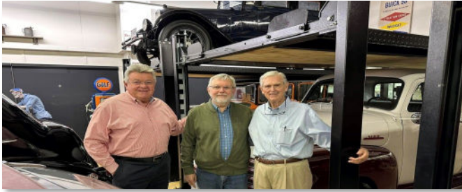
January - Meeting at the Henerson Collection