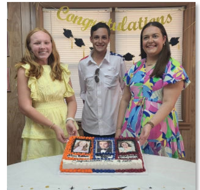
May - Summer Library Kick-Off & DSR Graduation Party