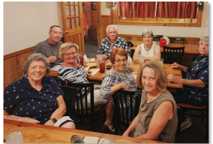
June - Fun Run to Rocky Creek Catfish Cabin With The Dixie Wings