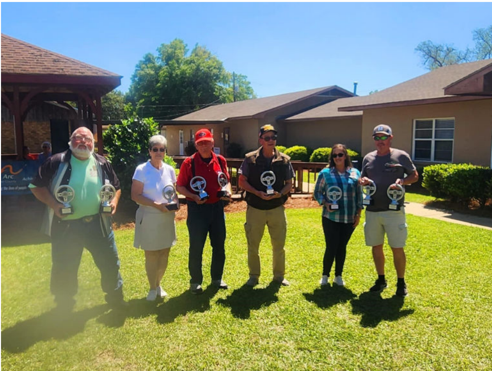
Trophy winners for the day!