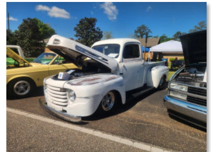
Nice resto-mod truck!