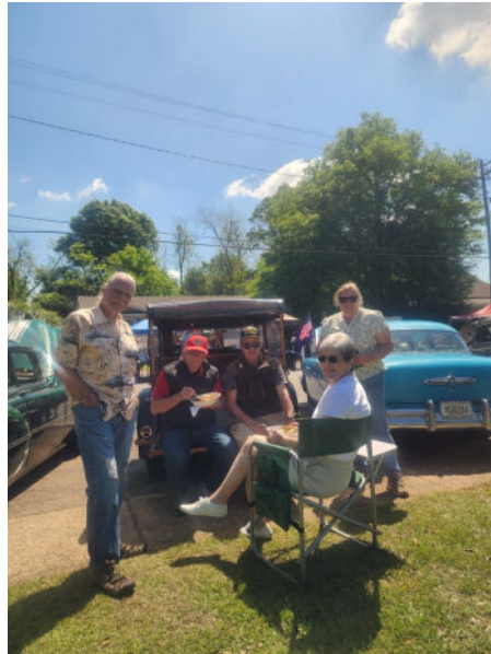
Tailgating - DSR Style!