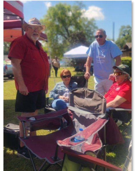
Enjoying the warm sunshine.