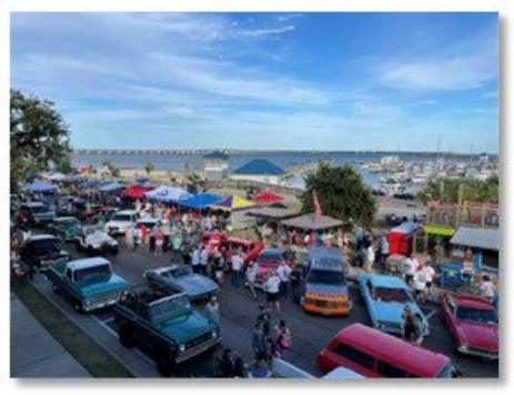
Bay St. Louis