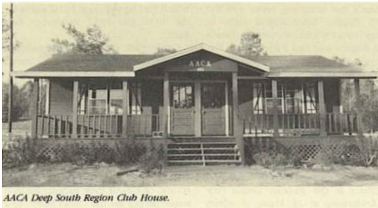
AACA Deep South Region Club House.