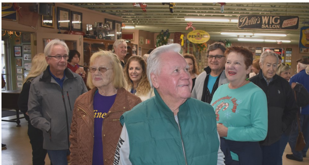
Members of the MCC