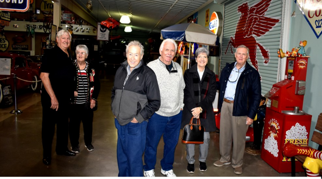
DSR Members on Tour

Along with the Mississippi Coast Corvette Club, several DSR members trekked to Metairie, Louisiana to visit the Henry Shane's Cars of Yesteryear Museum and to enjoy lunch at Middendorf's. Everyone had such a great time, that we are planning another outing for 2023.