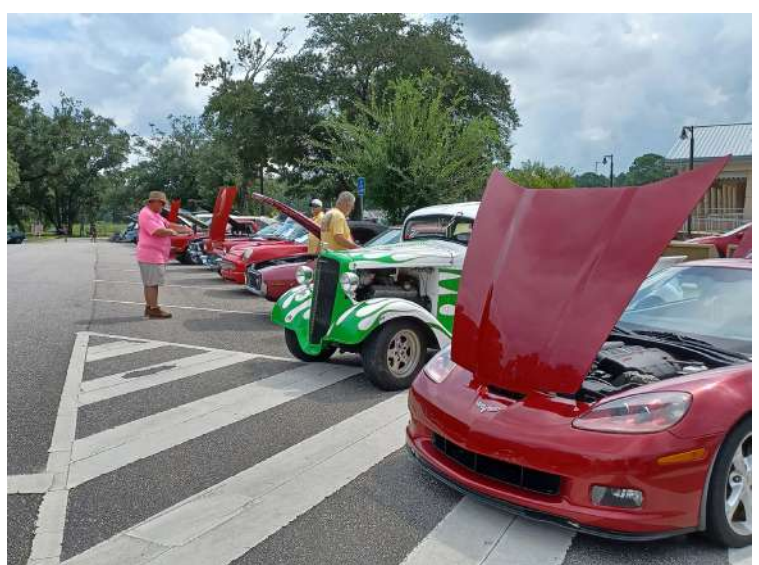
The Welcome Center was an great show location