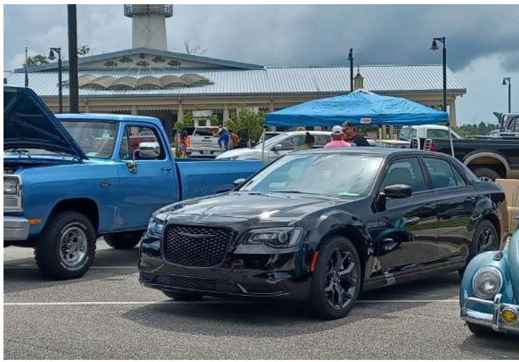
Lori Bosage's 2022 Chrysler 300 Touring took a top 30