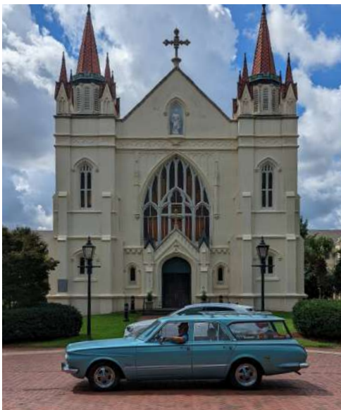
Ernie Roger's 1964 Plymouth Valiant Station Wagon