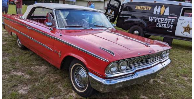
David Ladnier's 1963 Ford Galaxie 500 convertible