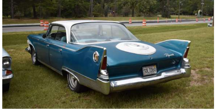
Gavin Smith's 1960 Plymouth Fury