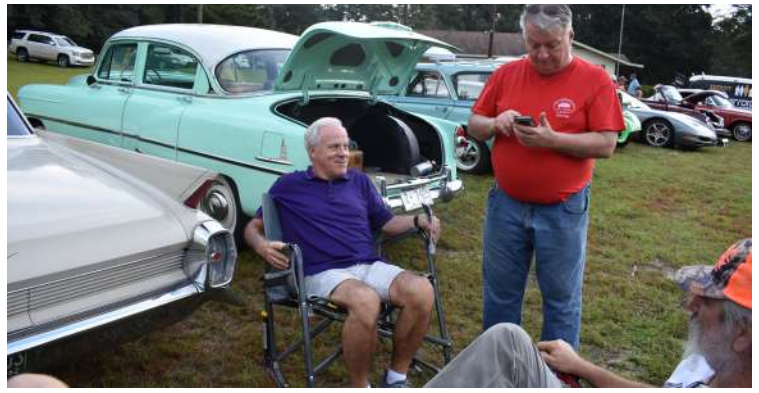
Time to relax and visit