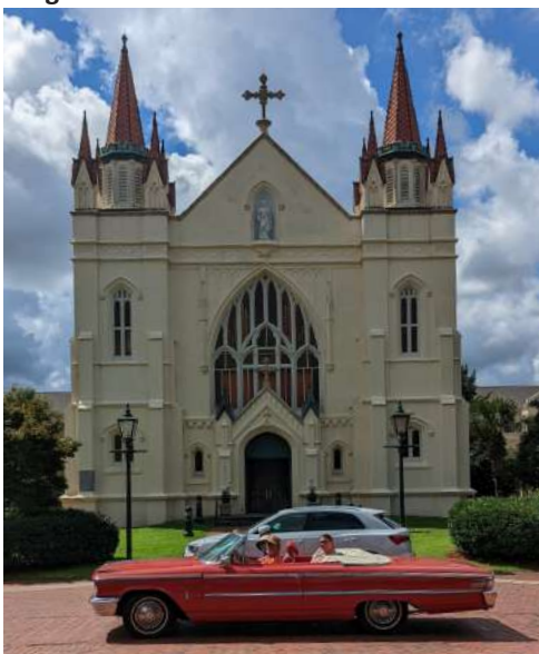
David Ladniers's 1963 Ford Galaxie 500