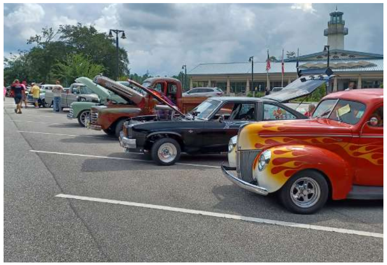
Quite an assortment of vehicles at the show