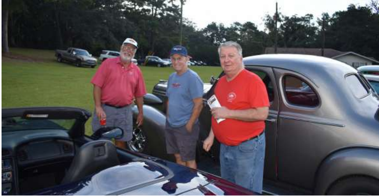
Membership team out recruiting new members