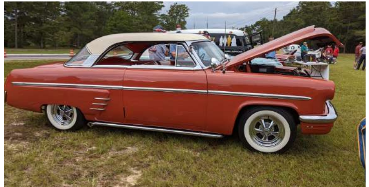
the old cars represented well as well