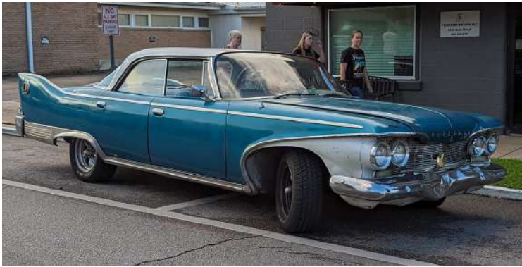
Gavin Smith's 1960 Plymouth Fury