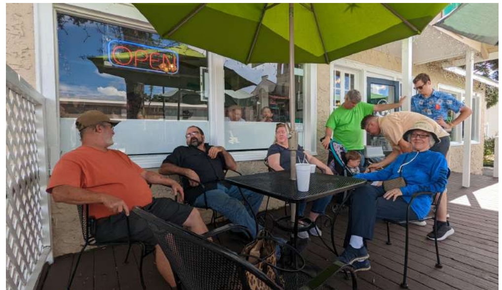
Enjoying ice cream in downtown Fairhope