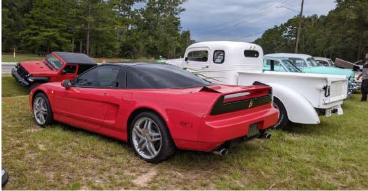
There was a wide variety of cars