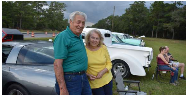
New faces at the clubhouse