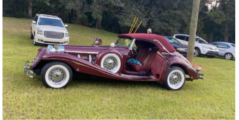
1930s Mercedes at the cruise in