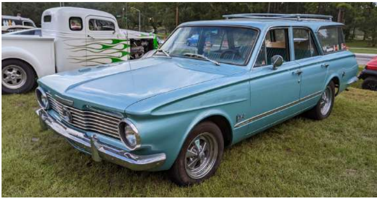
Ernie Roger's 1964 Plymouth Valiant Station Wagon