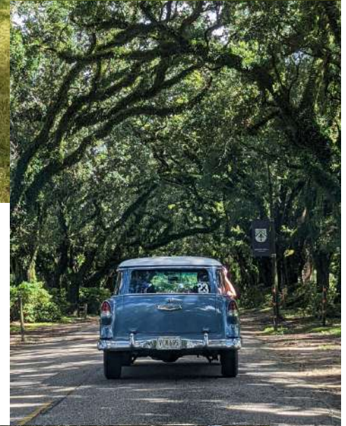
Darrin Dahlenburg's 1955 Chevy Bel Air 2 Door Wagon

The day was nice and we enjoyed every part of the beautiful day. - Charlotte