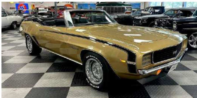
The 2022 "Make a Wish" Raffle Car

Ticket sales for the '69 Chevy Camaro convertible are doing well. Crusin’ the Coast is featured on Mississippi Lottery scratch off tickets.