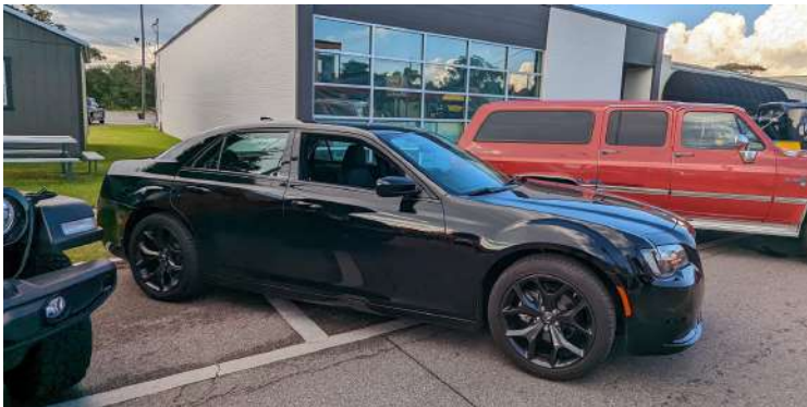
Lori Bosarge's 2022 Chrysler 300 Touring