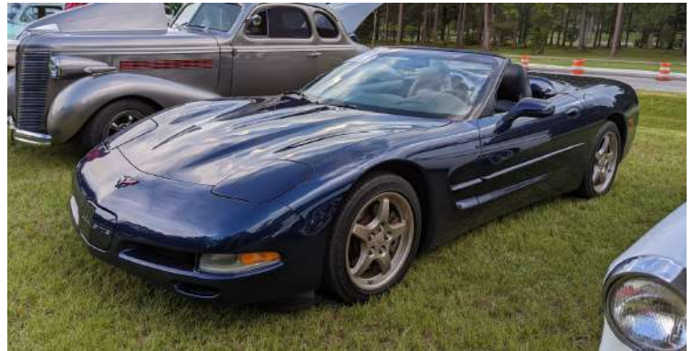
A newer corvette attended our cruise in