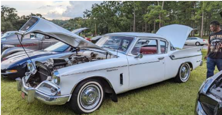
1957 Studebaker Hawk