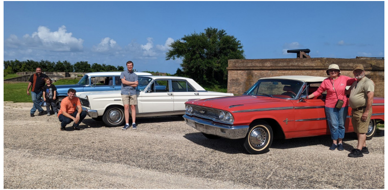
The group at Fort Gaines