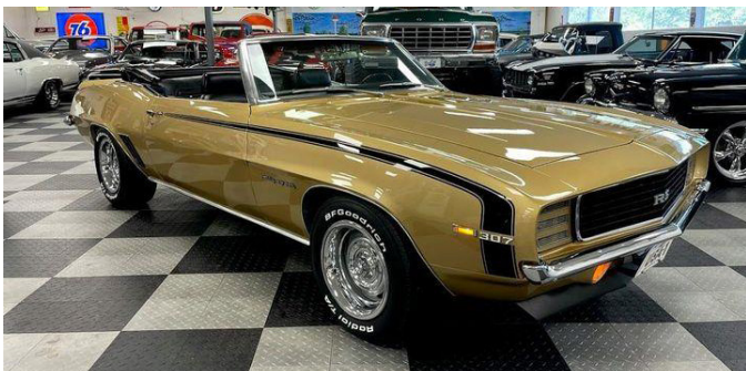
The 2022 "Make a Wish" Raffle Car

As of August 10, there are 6841 cars registered coming from 42 states, Canada and England. 960 are first-timers. Comps are due before August 15 Packing party will be Saturday September 24, 8am at the Coliseum. We will be making up 9500 bags. Ticket sales for the '69 Chevy Camaro convertible are doing well. Cruisin' the Coast is featured on Mississippi Lottery scratch off tickets.