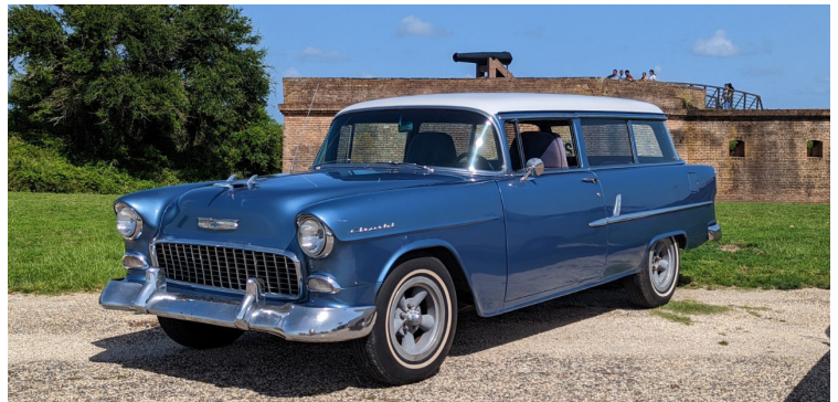
Darrin Dahlenburg's 1955 Chevy Bel Air wagon