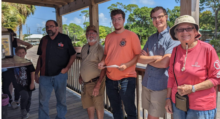
Ready to order ice cream