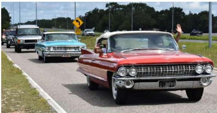
The group on the road to the drive-by birthday party