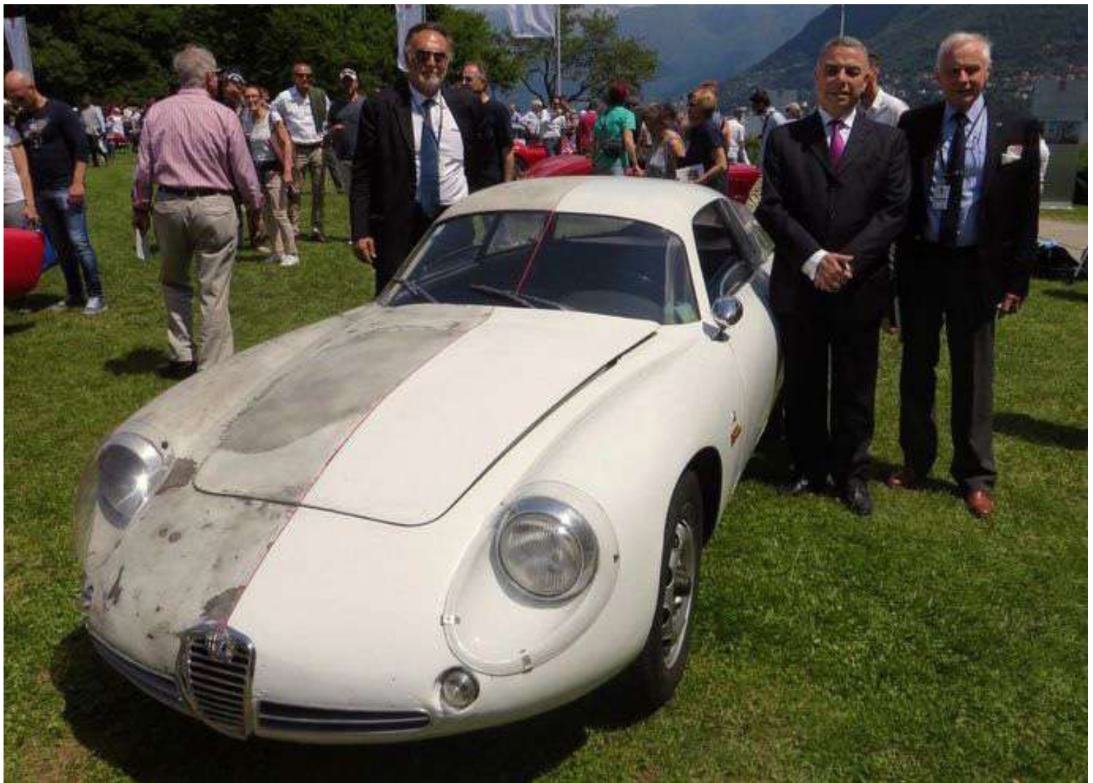
The prototype Alfa Romeo Giulietta SZ Coda Tronca that won a FIVA Preservation Award in 2016.