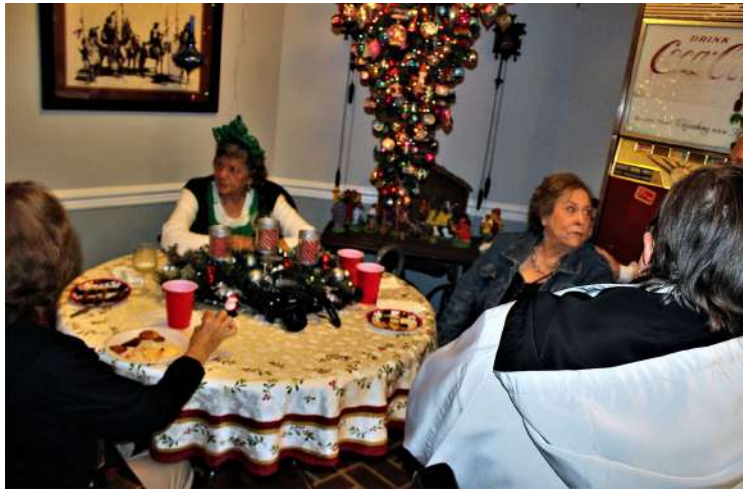
The club enjoys the many snack and cheeses that everyone brought