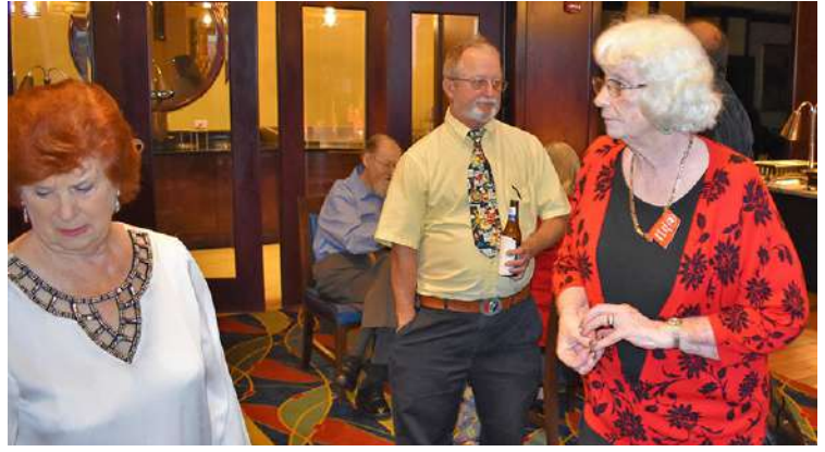
Everyone had a good time getting together