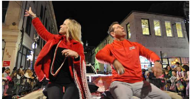
Ragin Cajun Athletic Director and his wife in the 1961 Cadillac