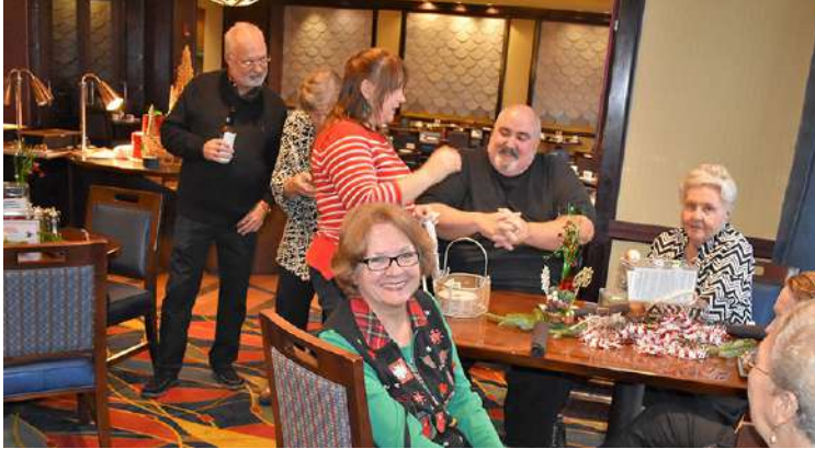
Enjoying time together at the Christmas Dinner Awards Banquet