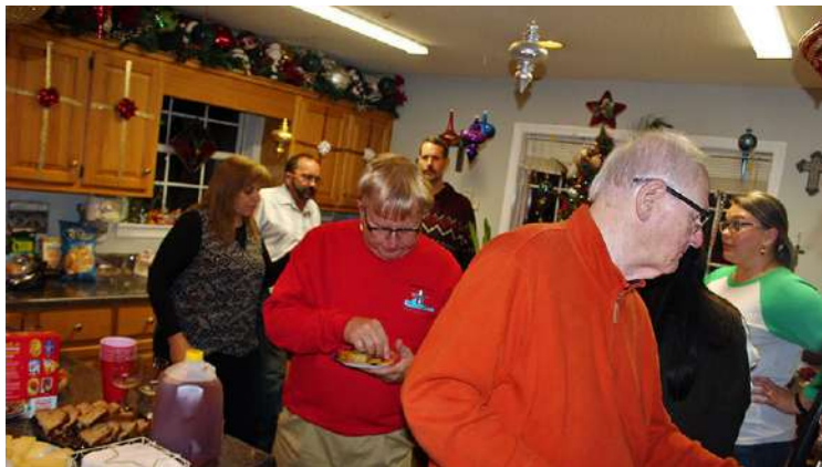
Everybody having a great time