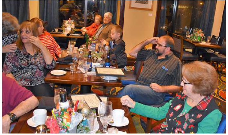
The group is ready for dinner