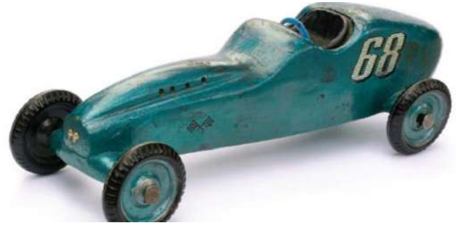
Speedster monthly e-newsletter articles courtesy of AACA

You can enter a car made from a kit or made completely from scratch. As long as the cars adhere to our dimensional and weight specifications, they can race. There is no age limit (young or old) and the $25 entrance