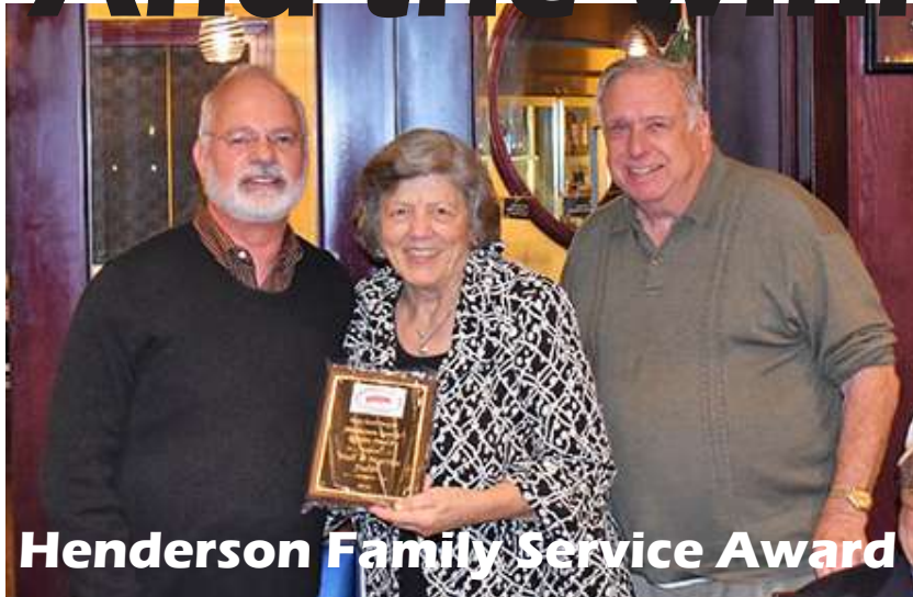
Henderson Family Service Award

The Henderson's have been long standing members of our club. They have willingly given their time, talent and money over the years whenever the need arose.