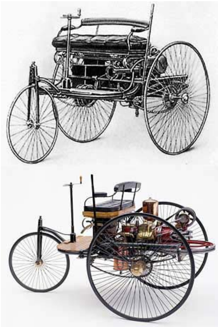
First German Car