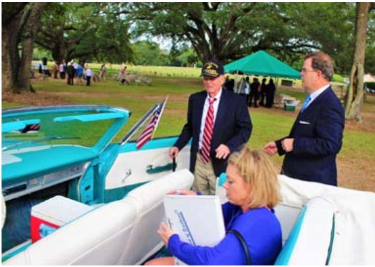
Getting ready to drive through Memorial Gardens