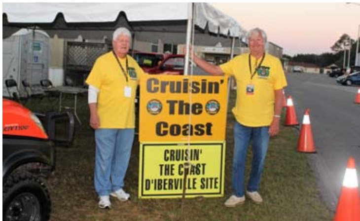
Many local people help at the D'Iberville Site