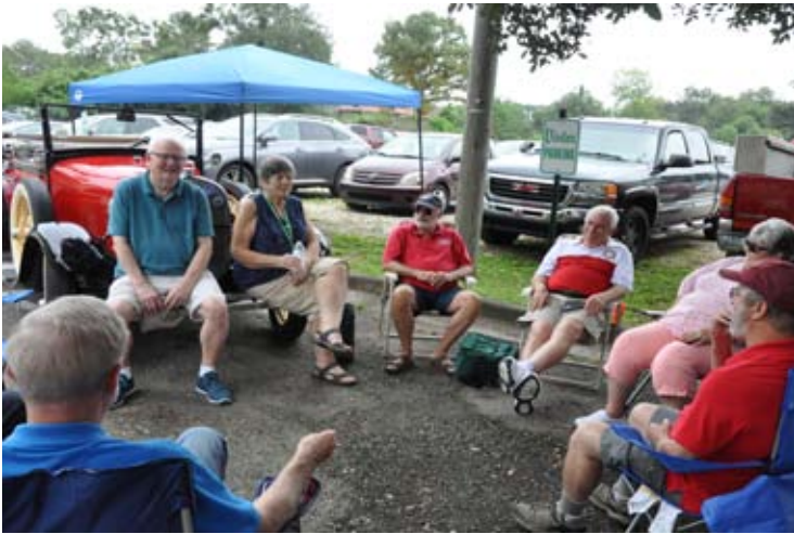
DSR members just enjoy sitting and talking with each other