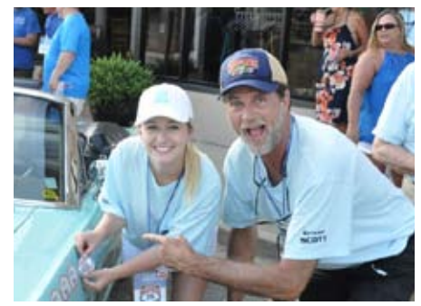
Nothing better than earning an Ace with your daughter!