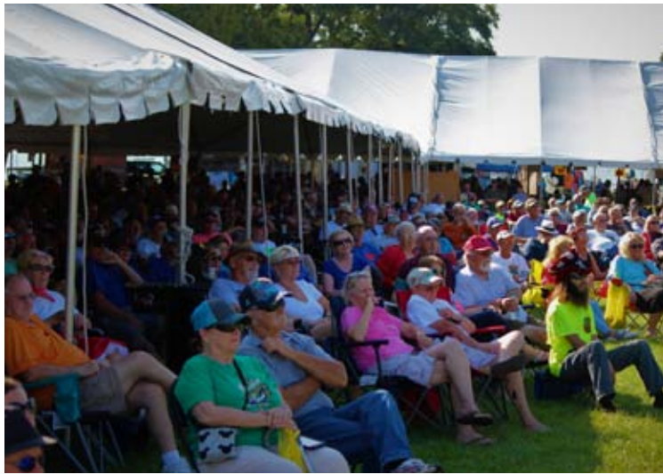
The crowd listens to the band at the D'Iberville site