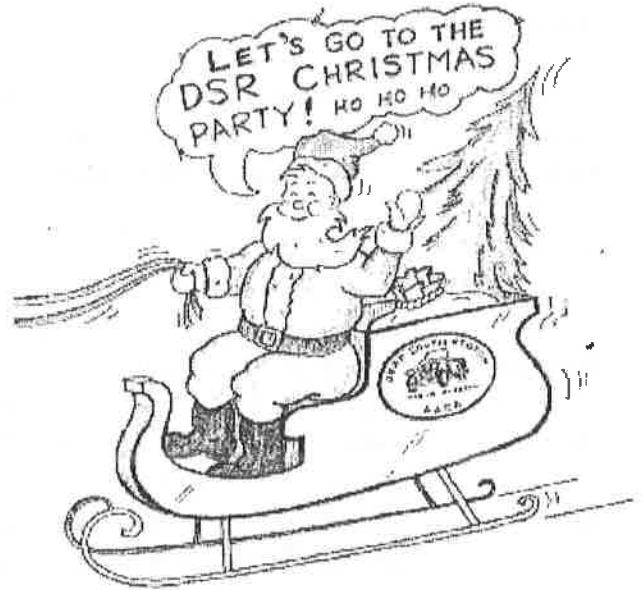
Drawing by Guy Short

(There will be Fat-free And Sugar-free ice cream, too)