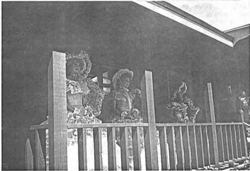
AZALEA TRAIL BEAUTIES ON THE CLUB HOUSE PORCH DURING OUR OPEN HOUSE ON SEPTEMBER 21st.

ANTIQUE AUTOMOBILE CLUB OF AMERICA DEEP SOUTH REGION 625 SECOND AVENUE SARALAND, ALABAMA 36571