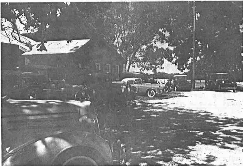
DSR CARS AT MAGNOLIA INN AT GROVE HILL, ALABAMA