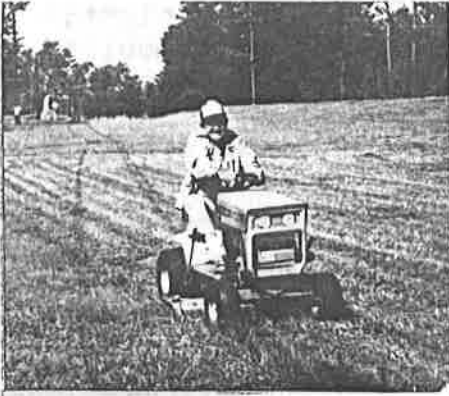
"OLE HOP" MOWING THE LOT. ELVIN AND FRED WERE ALSO MOWING.

On Saturday, September 29th, 20 DSR folks met on our club lot at Forest Hill and Zeigler Blvds. and all pitched in for a good day of work. We all cleaned up the lot, cut down under brush growth, mowed the grass, and even cut down a tall hurricane damaged pine tree. It was leaning and could have been dangerous. One of the city officials came by and saw what we had done and commented on how good the place looked! If you haven't