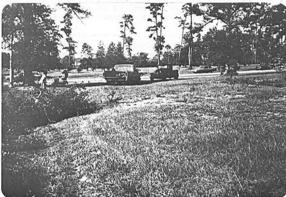
DEEP SOUTH REGION MEMBERS CLEANING OFF THE LOT - GETTING READY FOR THE CLUB HOUSE!

ANTIQUE AUTOMOBILE CLUB OF AMERICA DEEP SOUTH REGION 625 SECOND AVENUE SARALAND, ALABAMA 36571