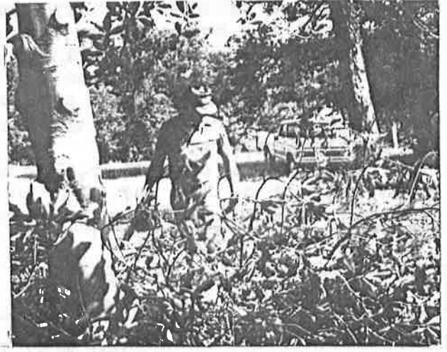
OUR PREZ GETTING THE JOB DONE WITH HIS TRUSTY CHAIN SAW!!!

seen it, by all means go by and take a look. It does look great and is an absolutely beautiful spot. It will make a grand club gathering place! We all had a very good time working together. At noon we had sandwiches, cold drinks, and desserts brought by our ladies. In