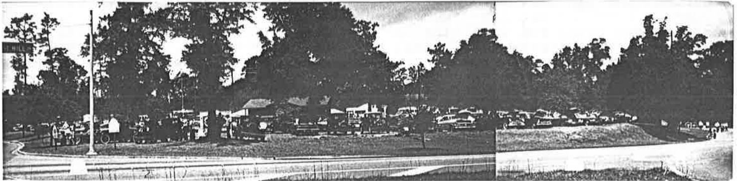
THE MAY 7th DEEP SOUTH REGION SHOW AT THE CLUB HOUSE.