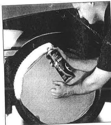
Cover wheel with a cardboard disc to avoid getting tire foam on chrome or polish.