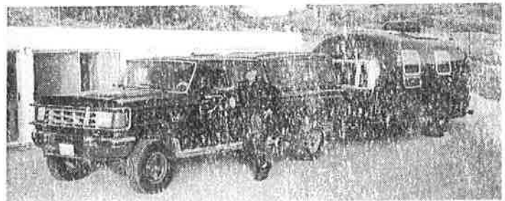
Larry Hagman and the tow vehicle with the "Genie Bottle"

It is referred to as the "Genie Bottle" which should give you a clue to the previous owner. He is a well-known TV star who played Maj. Anthony Nelson, astronaut, on the "I Dream of Jeanie" program and went on to become famous as J.R. Ewing on the "Dallas" series. Naturally, you have guessed by now that the previous owner is none other than Larry Hagman. He used the trailer primarily as a "hunting house" when he had the time to go. Later, he used it as a place to escape when filming on location in Texas. Although he had his personal dressing suite, it afforded very little privacy. Sometimes the filming would require being on location for three to four months at a stretch and he needed a spot that would provide some peace and quiet.