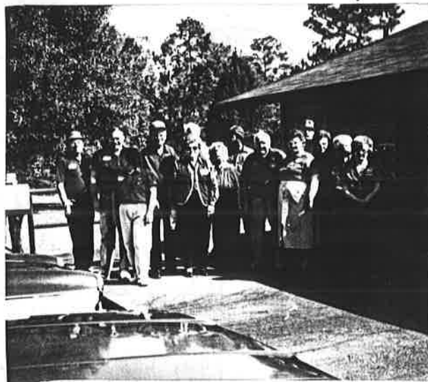
THE DSR GROUP AT THE CLUB HOUSE AFTER THE 911 OUTING.