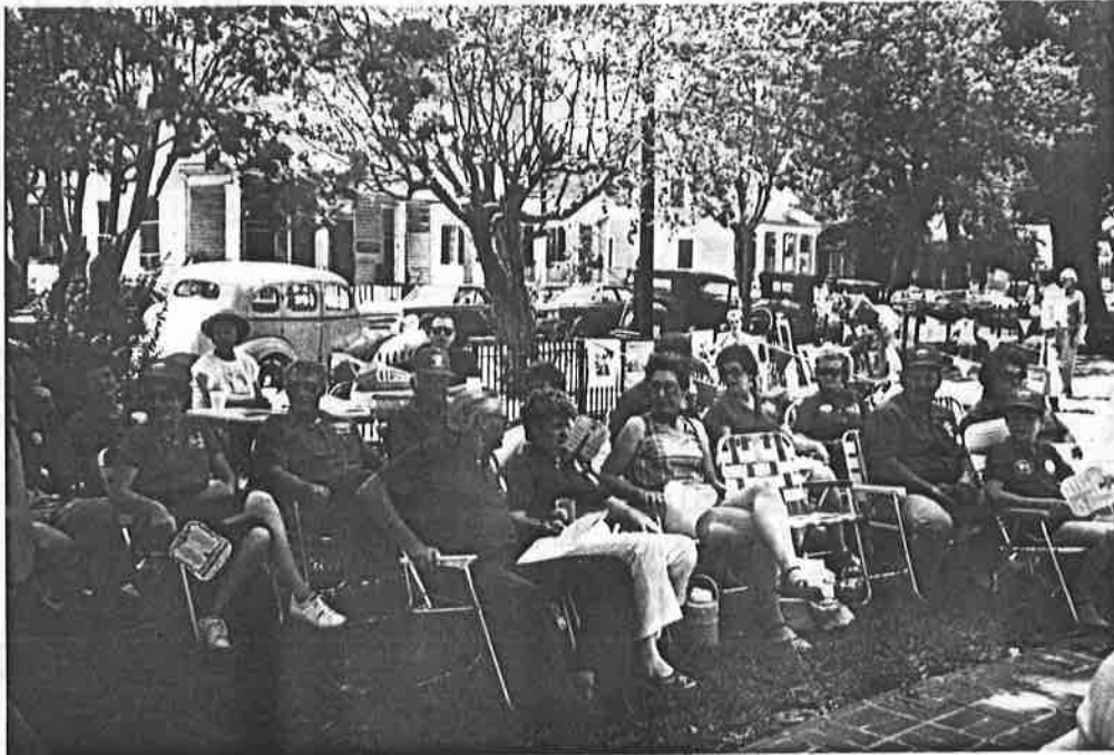
DSR MEMBERS AT THE BRITISH PARK. How many can you recognize?

ANTIQUE AUTOMOBILE CLUB OF AMERICA DEEP SOUTH REGION 625 SECOND AVENUE SARALAND, ALABAMA 36571