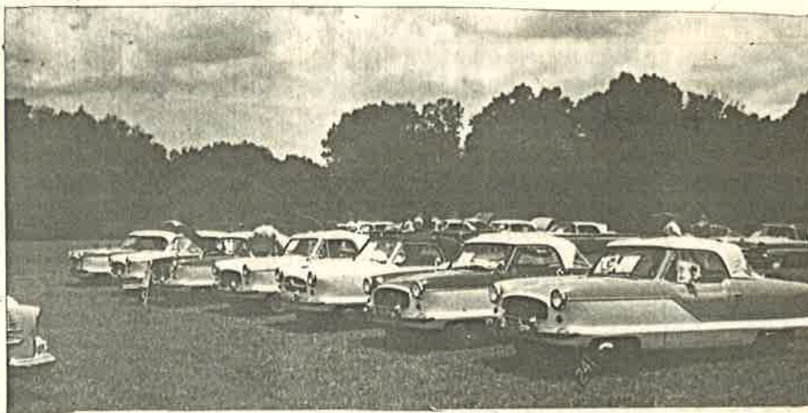
A GROUP OF METROPOLITANS IN CLASS 24 AT THE DSR SHOW ON MAY 11th.

Below is a very complimentary write-up of the DSR and our show that was copied from the West Florida Region's newsletter, "LUG NUTS & WENCHES!" The West Florida Region, our nearest AACA neighbor, is "on the move" and you can look for them to grow and become very active. Let's all support them!!