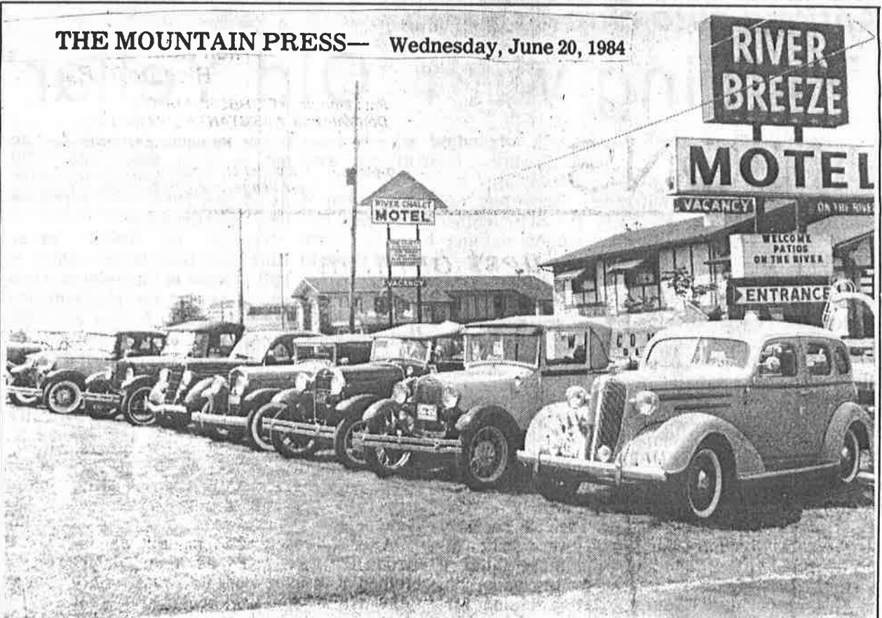
OLD YELLAR AND FRIENDS: Antique cars are touring the Smokies

THE MOUNTAIN PRESS— Wednesday, June 20, 1984