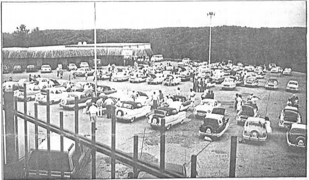
SOME OF THE 80+ METROPOLITANS READY FOR JUDGING. PHOTO TAKEN FROM MOTEL BALCONY WITH CONVENTION CENTER ON LEFT WHERE ALL SHOW BUSINESS WAS CONDUCTED AND THE BANQUET WAS HELD.

There were two parades with all Mets sight-seeing around Eureka Springs on Friday and a big one through town with 80 Metropolitans participating on Saturday, and that's a lot of Mets!! There were 80 Metropolitans registered for judging and several not registered. We were told that this was the most Metropolitans gathered in one place since the end of Met production in 1961! There were three categories of judging, 1. Original and restored to original, 2. Non-original, and 3. Modified.