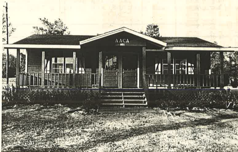
951 FOREST HILL DRIVE- THE CLUB HOUSE!

ANTIQUE AUTOMOBILE CLUB OF AMERICA DEEP SOUTH REGION 625 SECOND AVENUE SARALAND, ALABAMA 36571