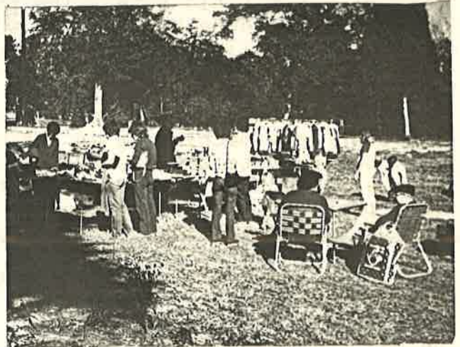
MEMBERS AND BUYERS AT THE DSR RUMMAGE SALE, 951 FOREST HILL.

is in the fact that the DSR cleared over $700. This will get us well out of the financial bind we were in with the surprising $450 water connection fee that was charged to