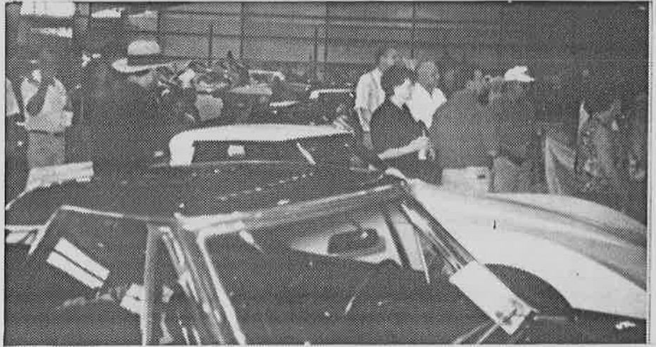
A FEW OF THE 128 VERY FINE CARS ON DISPLAY AND THE SPECTATORS AND OWNERS AMONG THEM.

On Saturday, August 14th, the Second Annual MDA (Muscular Dystrophy Association) open car show was held at the Fairground on Zeigler Boulevard. All the proceeds of this go to the very worthy cause of assisting the crippling muscular dystrophy victims and help find a cure. This is certainly of utmost importance! All the show cars were inside the huge building out of the weather and although it was hot, it was an excellent show with 128 vehicles registered! It was quite a turn-out! And the good news is that next year the building is to be air conditioned! There was a very good turn-out of cars from the Deep South Region. We had 26 of our members there and 17 DSR antique cars.