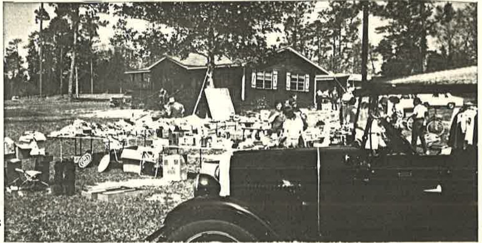
HOW THE MARCH RUMMAGE SALE LOOKED!