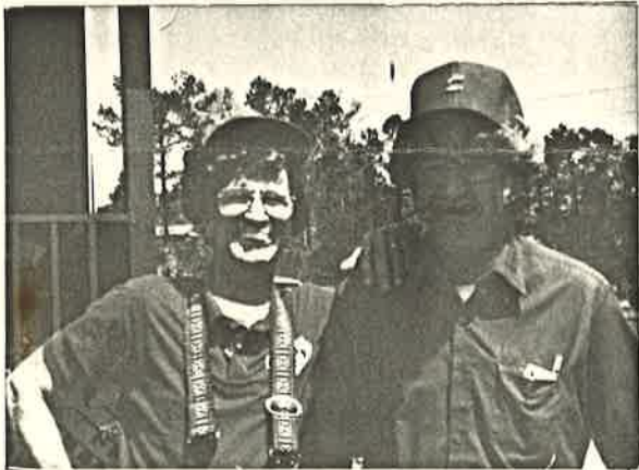
A COUPLE OF UNIDENTIFIED HIPPIES AT THE DSR SALE!!

antique cars and parked them around the lot on Forest Hill Drive and Zeigler Blvd. to attract customers. Everyone did a most remarkable job, a real tribute to our DSR members. Around 5:00 P.M. we started putting things away, cleaning up, and with each worker a bit pooped out, closed shop for the day. The few items that did not sell were taken to a permanent flea market shop and sold the following