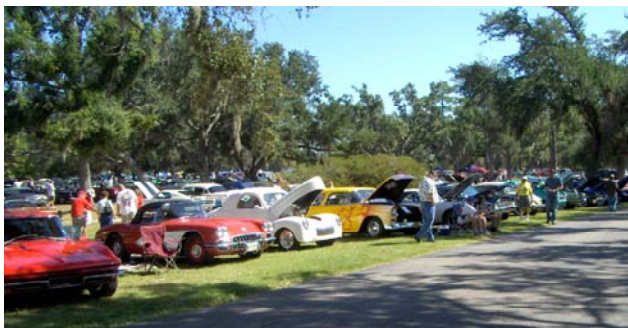
A portion of the VA Center parking area

One of the highlights of Crusin' for us is the visit to the VA Center in Biloxi. Once again this year, it was jam packed with some of the choicest vehicles around. We got there at 9 a.m. and were parked on the outer periphery. Only an hour later, incoming cars were being placed in a holding area and sent in as space became available. As in the past, free hot dogs and Cokes were available for all, as well as a pretty good Elvis impersonator. The VA provided transportation for the patients so they could get