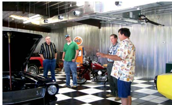
The new area of the Musgrove’s garage is “WOW!”