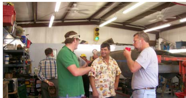
This is some serious “shop talk” !