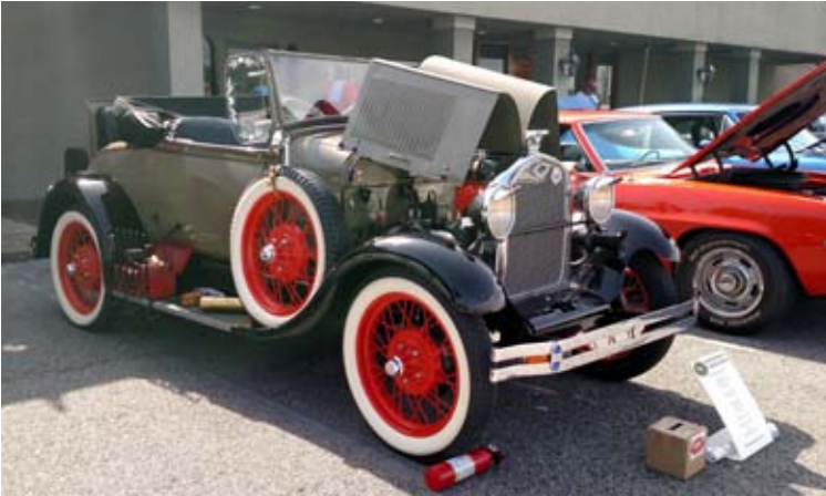
Dick Cashdollar brought out the 1928 Model A Roadster