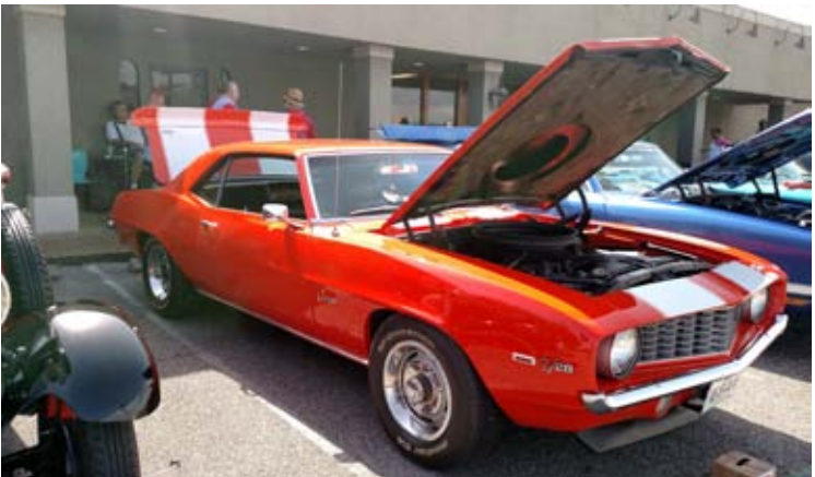
Zeno Chaudron brought out the 1969 Chevy Camaro Z-28 X77