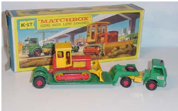
Matchbox King Size

In the 1960s, Matchbox faced stiff competition from Hot Wheels and Johnny Lightning toys in the United States. It ran through some difficult times until it developed its "Superfast" line of cars in 1969, which featured low-friction wheels for the 1970 model year, along with a series of tracks.