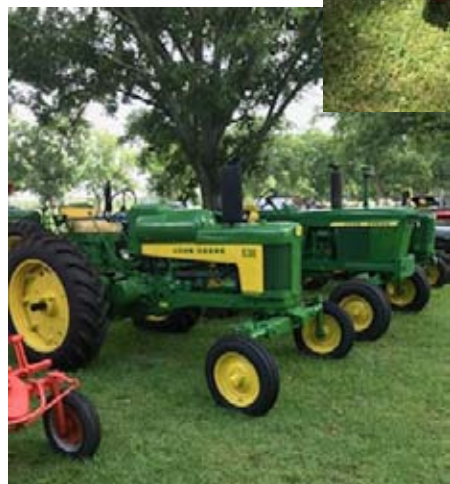
Sebveral of the antique tractors on display at the Plow Day Festival.