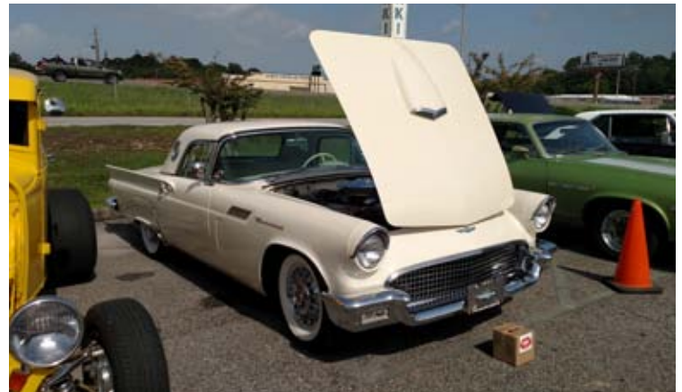
Ed Grimes brought out the 1957 Ford Thunderbird