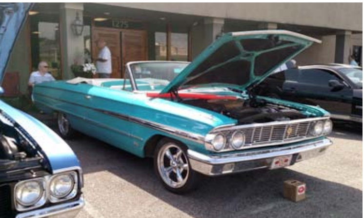
David Ladnier displayed out the 1964 Ford Galaxie 500