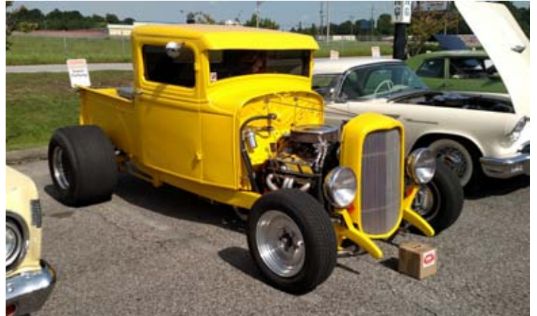
Frank Piper displayed the 1932 Chevy Pick Up