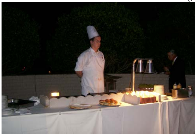
DSR’s personal chef set up on the patio

Our Webmaster Thoms has posted many pictures of the event on our DSR website ( http://local.aaca.org/deepsouth/ ) so if you’re not at the meeting to see the scrapbook, get on the web. Herb does a good job but can use members’ help, too.