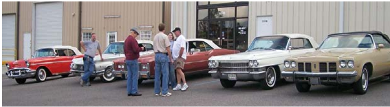
Drivers getting their car assignments prior to leaving for parade