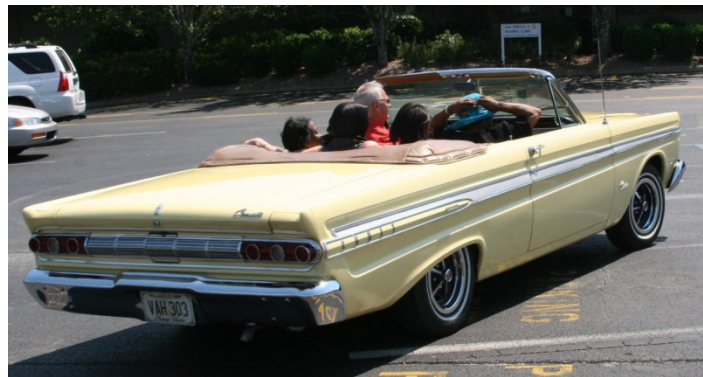
Others will lament the loss of it's people hauling abilities

SO, the Comet squeaks into a Category 3 . Strengths are the mechanics and weaknesses are the exterior condition. I actually think this is a fair rating for this car. It's not spectacular, but it's a very dependable driver and people like it at the shows and the parades, mostly because it's a convertible.