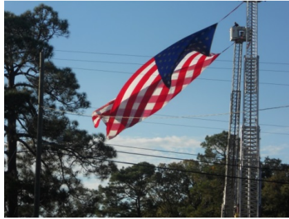
US flag displayed by Mobile Fire Department from aerial ladders.

On November 10, 2013 the Mobile Bay Area Community Action Group conducted a Lumineers for Veterans Celebration in McNally Park. The activities began with music provided by the B.