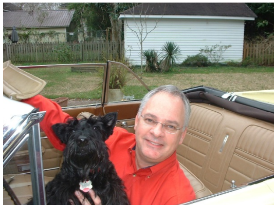
Rupert will be depressed if we get rid of it