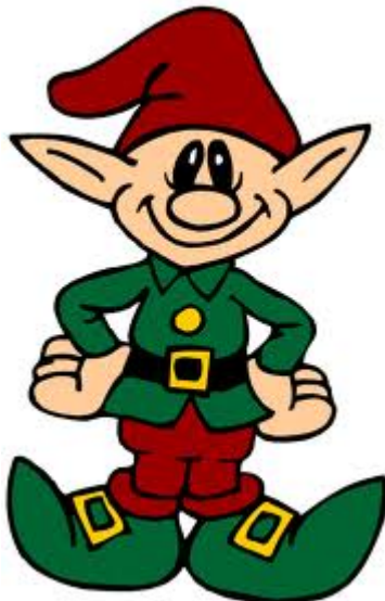
This may or may not be Third Elf

The holiday season is a very busy time of the year. This is especially so for Santa who's getting ready for his big ride. After going through various contacts, I was able to hook up via email with one of his Elves. It should be noted that the Third Elf is a pseudonym as, typical of elves, they are not always appropriate.