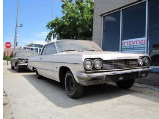
This 1960s Chevrolet Impala would make for a great weekend cruiser.

Editor's Note: If this article is of interest, you can view several youtube.com video's. Search for Lambrecht or VanDerBrink. It is truly amazing to watch them pull these 50's and 60's cars (Mostly Chevrolets) out of storage that have 1 to 4 miles on them, some with the plastic still on the seats. Paul Dagenais, Editor.