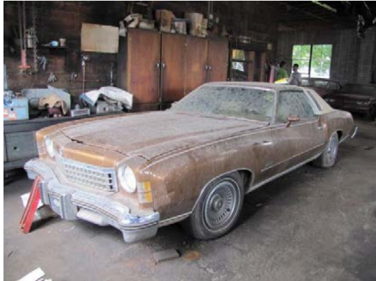
This mid-1970s Chevrolet Monte Carlo coupe is an amazing time-warp original back to the dawn of the disco era.