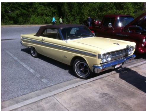
The Comet minded her own business. Note: See Lou's Dodge on Page 3