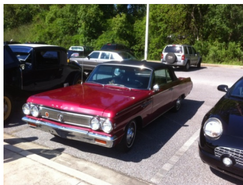
Patt's Buick saved the day