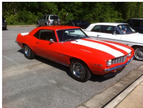
Zeno's battery eating hotrod ride