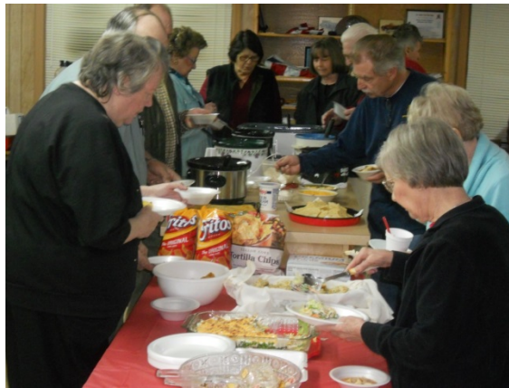
Stage II: The Load-Up