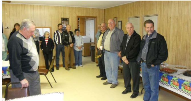
Stage I: The Anticipation

The DSR Chili dinner was a success. As is the usual situation, it consisted of three major components: