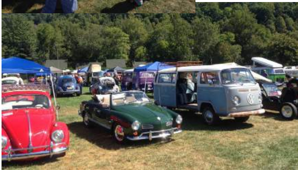
The bonus VW Show and the Wheels Through Time Museum.