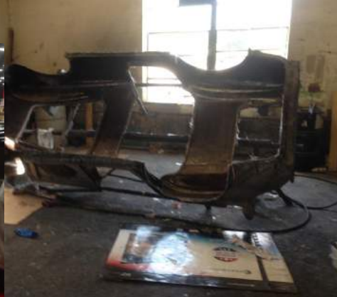
Unique Motorcars of Gadston Alabama. Top left: All the parts in the parts room. Top Right: Customer cars. Left: Body in the process of being built. Far Left: Showroom floor