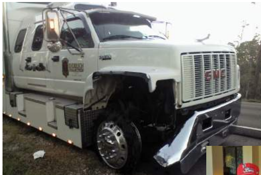
While the guys were waiting for roadside service they had a roadside service.