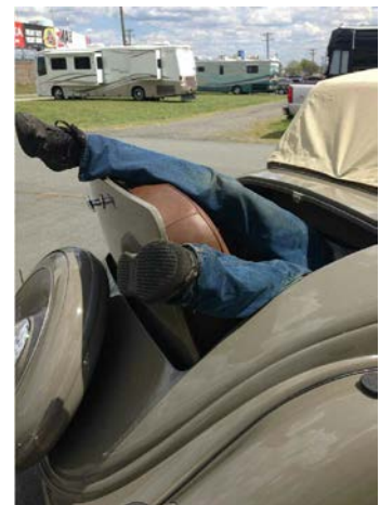
Cleaning the rumble seat!

I left the guys to finish cleaning and polishing the car and I went into the infield media center of the track and took judging school. I learned a lot about how it works and why it works. Judging on a point system is a very fair way to judge. Cars are not judged one car against another. All cars start with 400 points. A Judge in each category judge, exterior, interior, chassis and engine along with one team captain, each having guidelines of what to look at, they may or may not deduct points for various short fallings.