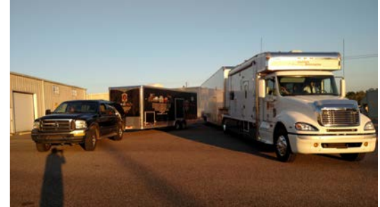
Ready to go.