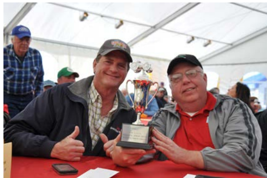
Getting the First Place Junior