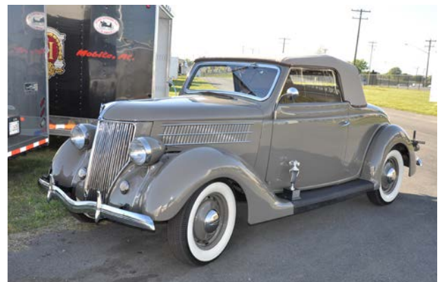
The Cabriolet with her award.

At the award ceremony they called car after car. I kept thinking "did